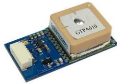
Figure 6. Ardu Pilot Mega, Ardu IMU Shield and Mediatek GPS

The target fuselage is made of composite materials, based on epoxy resin, glass fabric reinforced and carbon tape hardened. The wings and empennage are cut from polystyrene, covered with 1 mm thick balsa wood and a layer of glass fiber, vacuum formed. Figure 7 presents the 3D general assembly.