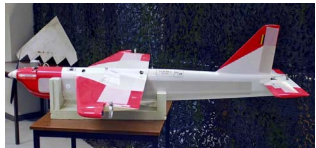
Figure 3. ULTIMA target

- X-SIGHT Airframe Germany is an aerial target designed for the training of the operators and crew within the close anti-aircraft defense systems. It is fitted with reflector prisms, or Luneberg lens, IR tracers and smoke generators. It disposes of a parachute recovery