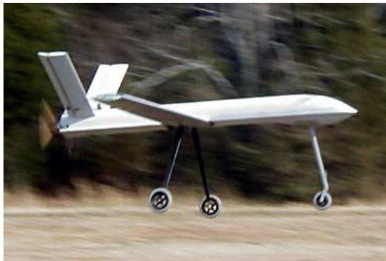
Figure 2. MQM-170 "Outlaw" [6]

possibility of the waypoint autonomous navigation, on a pre-programmed flight path. The plane is figured so as to cover some automated recovery procedures on the occurrence of nonconformities like losing the satellite connection, or the radio communications. It may be recovered either by wheel landing, or by "belly" landing, or by parachute opening. The maximum effective load is of 18 kg. This may be: an IR amplifier or a laser multi-integrated system, a night operations illuminator, a smoke generator or a Doppler radar system for the shooting estimation.