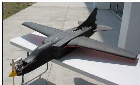
Figure 1. FQM-117 Target [4]

- MQM-170 “Outlaw” designed as a multi-function, not too expensive, target, which can also have the role of unmanned air vehicle. It is fitted with an autopilot and GPS that provides the waypoint autonomous navigation. It is really adaptable, it can accomplish different missions and it can bear many sensors and load types. It is currently used by US Army as aerial target, for the training of anti-aircraft forces [6].