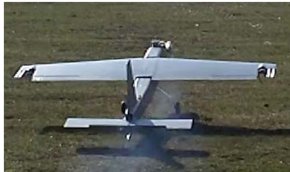
Figure 5. LICURICIUL

Figure 5 presents the target, and in Table 5 its main features are specified.